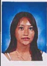
8 th grade