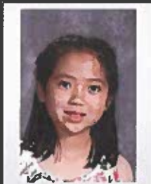
6 th grade