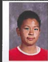
6 th grade