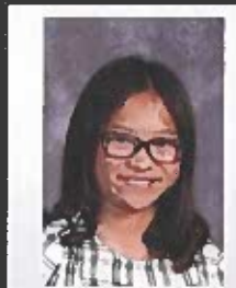
6 th grade