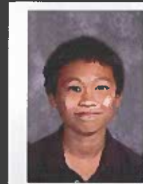
6 th grade