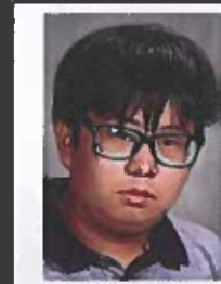
7 th grade