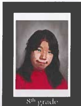
8 th grade