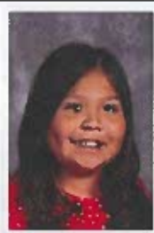
6 th grade