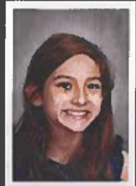
6 th grade