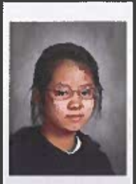
7 th grade