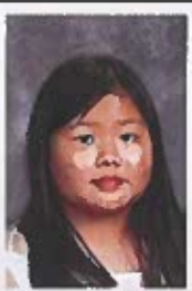
6 th grade