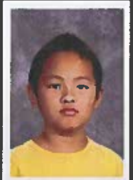
6 th grade