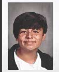
8 th grade